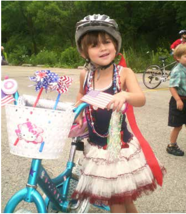
The Annual Decorated Bike Parade was once again led by our neighborhood fire-fighters and followed by sack races, tug-of war competitions, water balloon tosses and great food. The day was overcast but pleasant and made for a great opportunity for neighbors to visit and celebrate our nation and our freedoms.