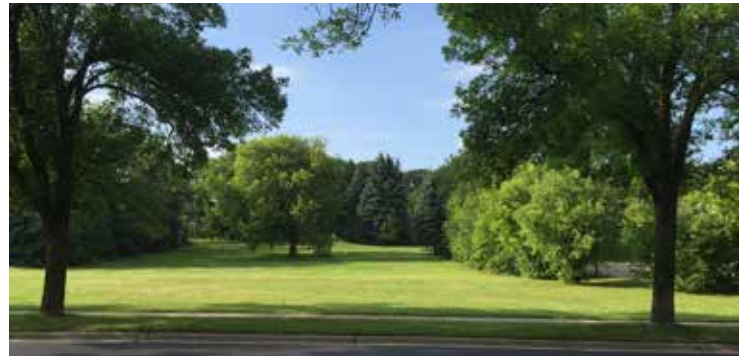
Looking north from Colony toward the site of the proposed daycare center.

Also discussed were the process for obtaining a conditional use permit, what other potential uses might seek such a