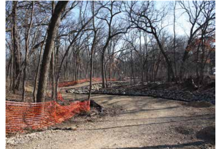
A new path has been built along the creek in Owen Conservation Park.