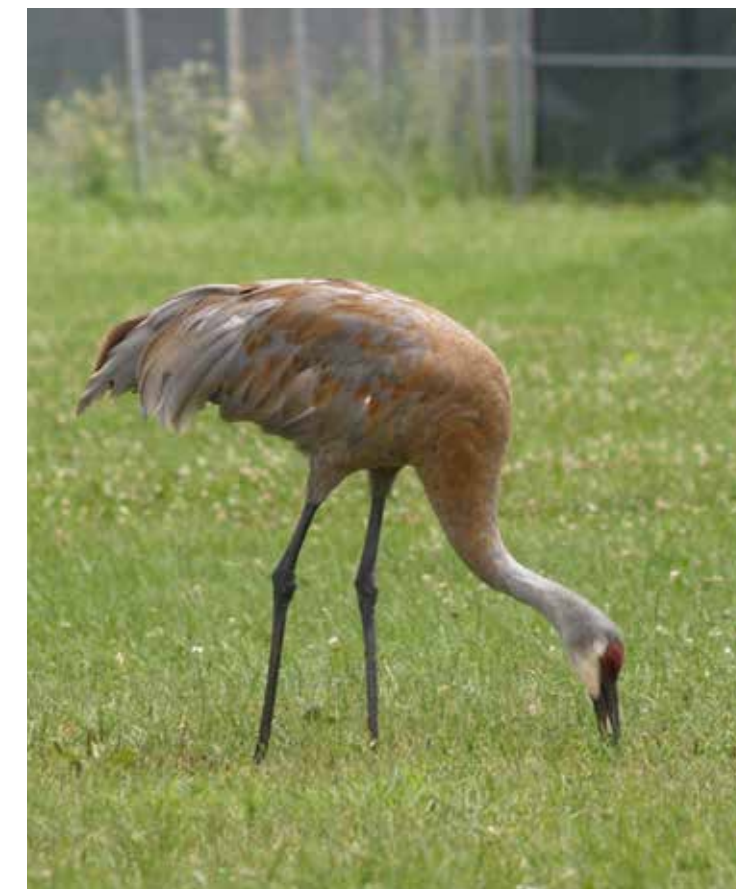
Parkwood Hills residents have been delighted by a pair of Sandhill cranes who've been frequenting the school fields over the summer and this fall.

"You pray for the hungry. Then you feed them. That is how prayer works." -Pope Francis