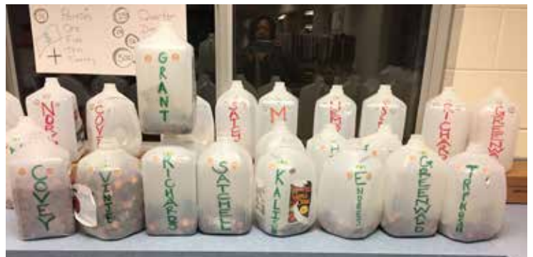
Jugs of pennies compete in the Penny War.