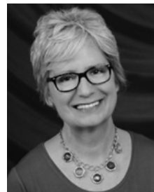
Parkwood Hills resident

Nobody serves you better in Parkwood Hills