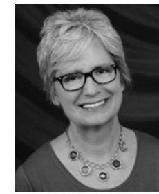
Parkwood Hills resident

Nobody serves you better in Parkwood Hills