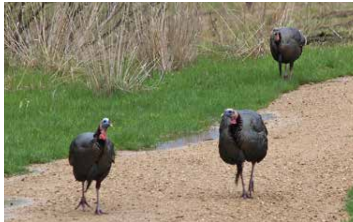
Turkeys are abundant in Owen Park this year. Photo from April, 2017

The Parks Department shared that the sick deer wandering around our neighborhoods several months ago did test positive for Chronic Wasting Disease (CWD). It is possible that other deer in the park have been exposed to this