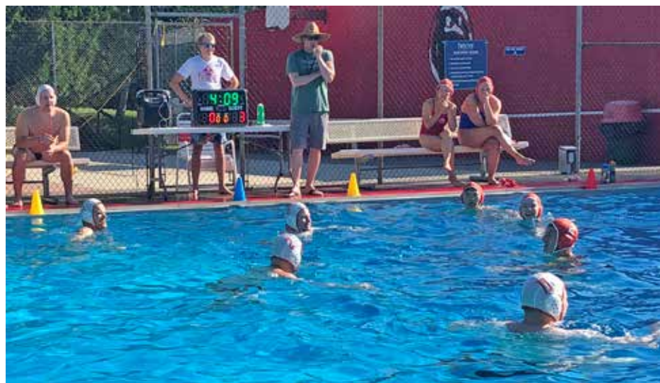
Water polo provides the contestants with a challenging work-out.