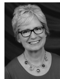
Parkwood Hills resident