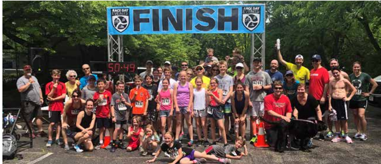
Race participants celebrate with popsicles at the finish line.

To celebrate and commemorate Parkcrest's 50th anniversary, many events were planned. Here are just two of them.