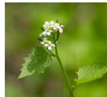
Garlic mustard in flower

If you don't have a bag handy, pull as much of the plant as you can, snap off the seed head/flower, and leave the seedless plant on the path. I stuff the seed heads into my pocket for disposal at home. Flowering garlic mustard that has been pulled and left to die on the path can germinate quickly and spread seeds far and wide. They are adaptive little plants!